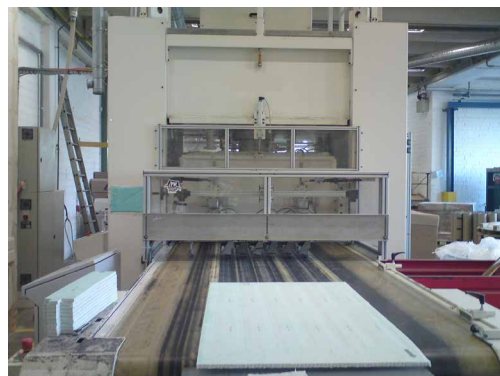
Enclosed cutting operation