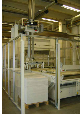
Automatic board feed

Below are some examples of die cutting machines: