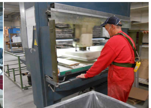
Non-enclosed die cutting machine

There are a large number of variables within the die cutting process, all of which need to be considered when constructing a dust control system. The system needs to control exposures during both cutting and handling activities, i.e. not focusing solely on the cutting mechanism. Particular attention should be paid to the handling of cut parts, off-cuts and waste.