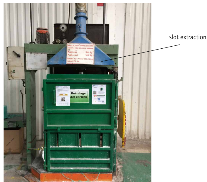
Fig. 2: Press for empty bags with LEV capture device (slot extraction) linked to LEV system