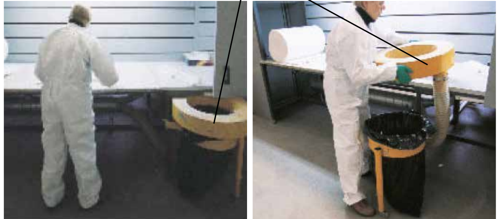
Fig. 3+4: Bin for off-cuts in finishing tasks. In case of handling ASW/RCF person needs to wear a mask (appropriate PPE).