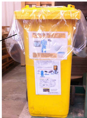
Fig. 3+4: Bin for off-cuts in finishing tasks. In case of handling ASW/RCF person needs to wear a mask (appropriate PPE).